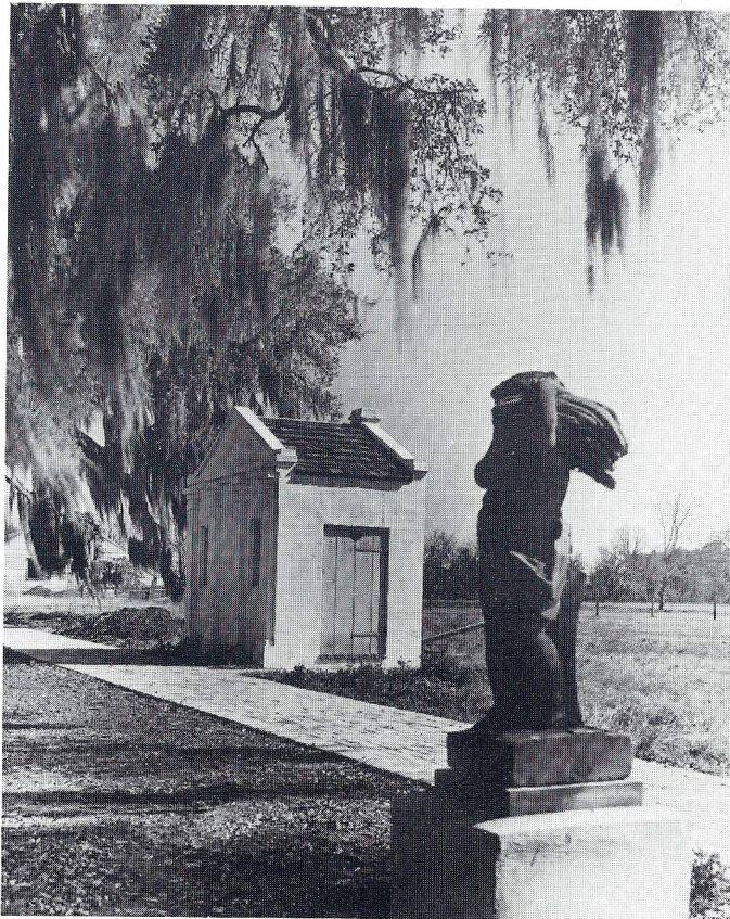
Clarence John Laughlin, Classic Privy

Frederick Sommer (American, born 1905) All Children are Ambassadors; Idée et Orchidée; Flower and Frog , vintage gelatin-silver prints, 8 x 9 \frac{3}{4} . Purchase with funds from Georgia-Pacific Corporation. 1985.236-238