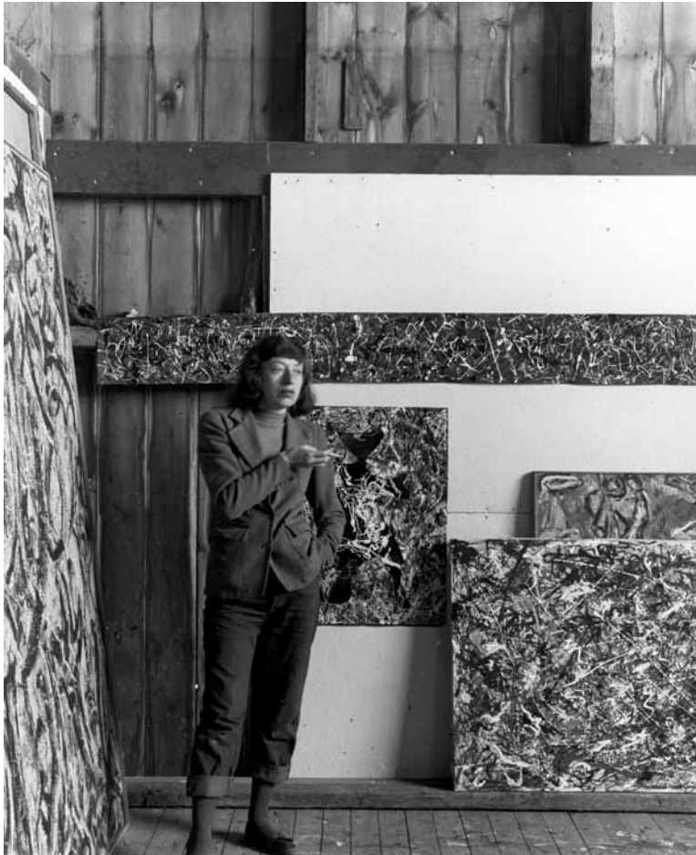
Lee Krasner.

Disappointed with sales, Pollock made a decision to leave Betty Parsons, a move that affected Krasner's career as well. Pollock moved to the Sidney Janis Gallery in spring 1952, and Parsons soon told Krasner that she could not continue to show her work because the association with Pollock was "too painful." 33 Ossorio stayed with Parsons, but his belief in Pollock remained strong. As for Pollock, despite his personal problems, he continued to attract attention, especially from Greenberg, who organized his "first retrospective show" (consisting only of eight paintings) at Bennington College in Vermont from 17 to 30 November 1952. For that occasion, Ossorio lent Krasner and Pollock his station wagon to drive up to the show. Greenberg and the painter Helen Frankenthaler were also in the car, but in the face of Pollock's uncontrollable drinking, they returned home by train. Pollock and Krasner made it home safely, but many of their relationships deteriorated under the pressure of Pollock's antisocial behavior.