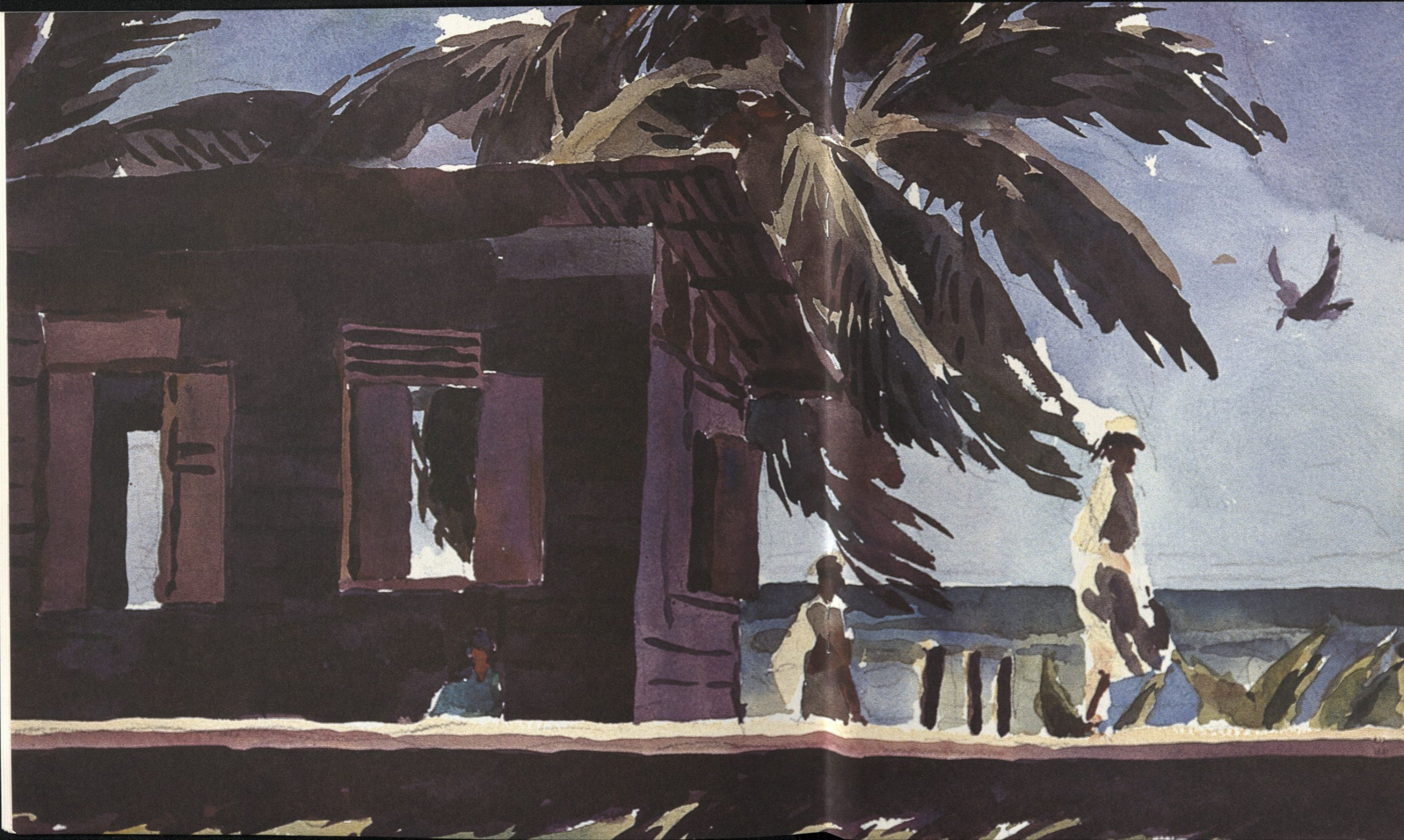
Guaya Wind 1999 Watercolour 13 x 20 inches