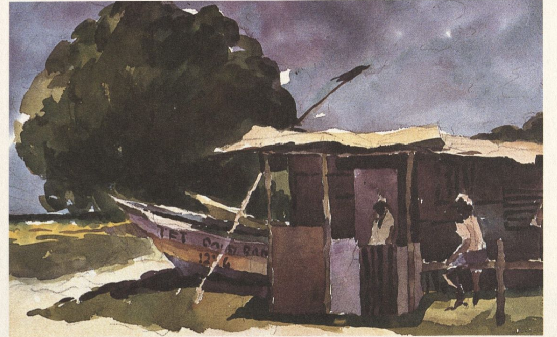
Boatman's Shed 1999 Watercolour 13 x 20 inches