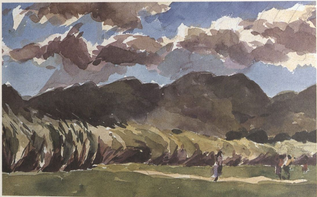
Canefield 1999 Watercolour 12 x 20 inches