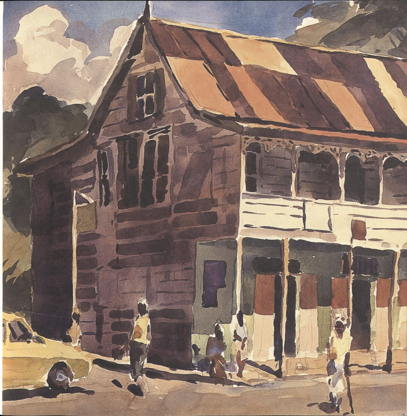
Right Toco Shop 1999 (detail) Watercolour 20 x 26 inches