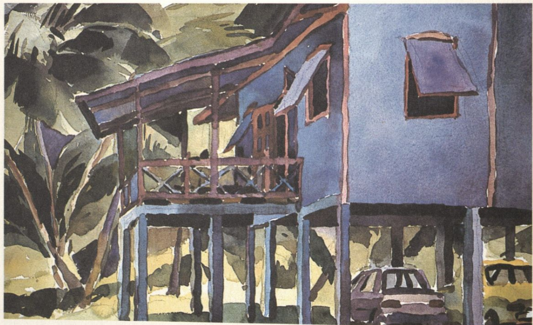
Above The Blue House 1999 Watercolour 13 x 20 inches