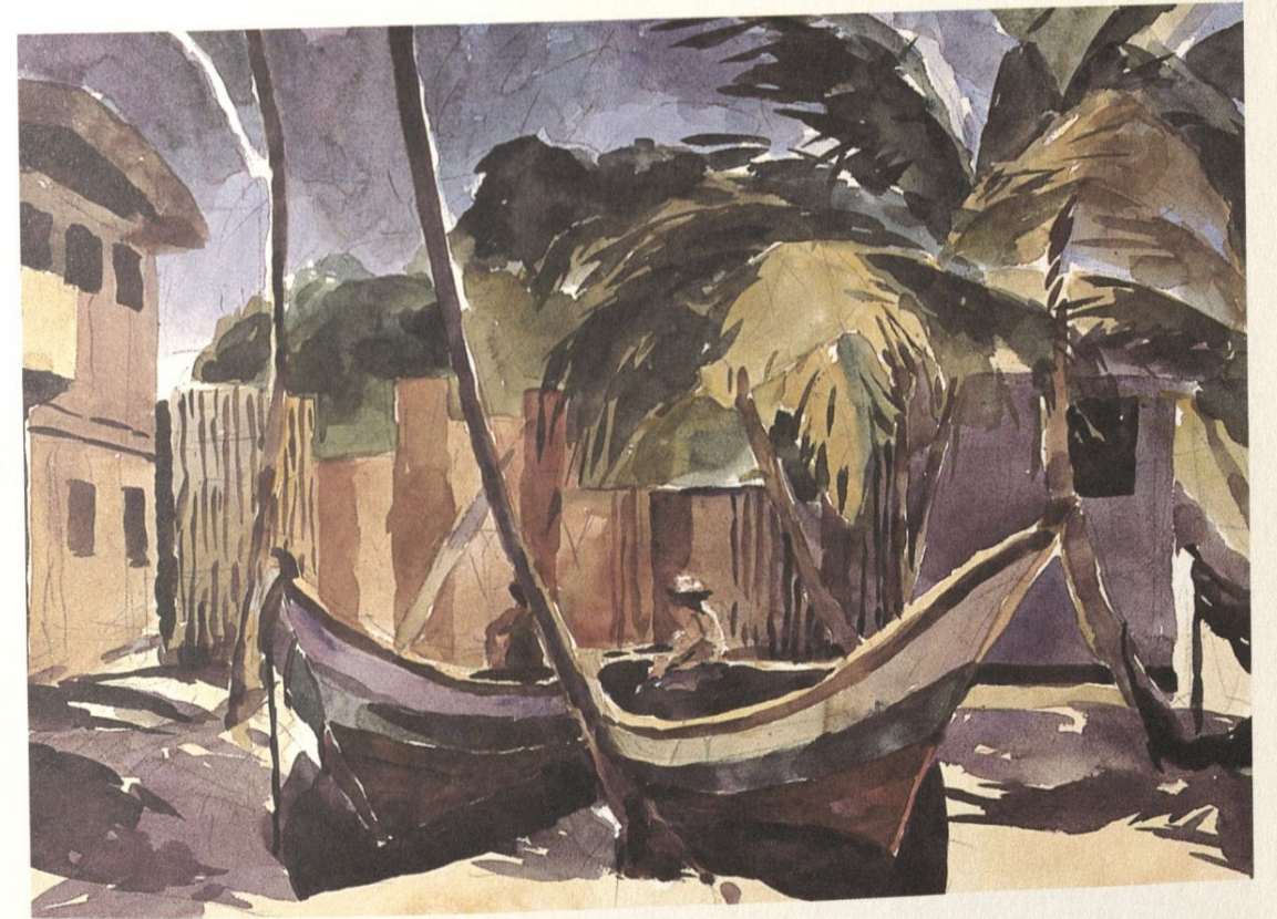
Mayaro Pirogues 1999 Watercolour 20 x 28 inches