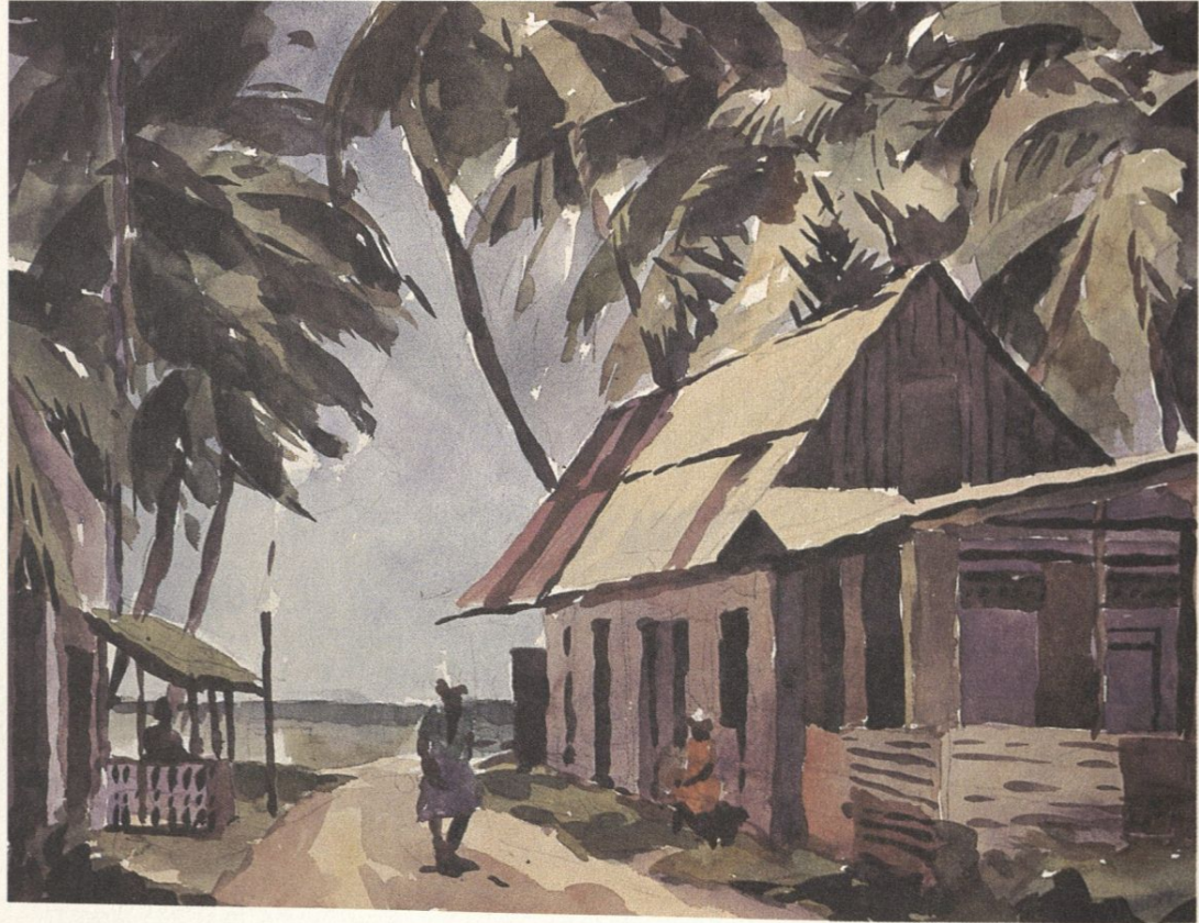
Coconut Estate 1999 Watercolour 20 x 26 inches