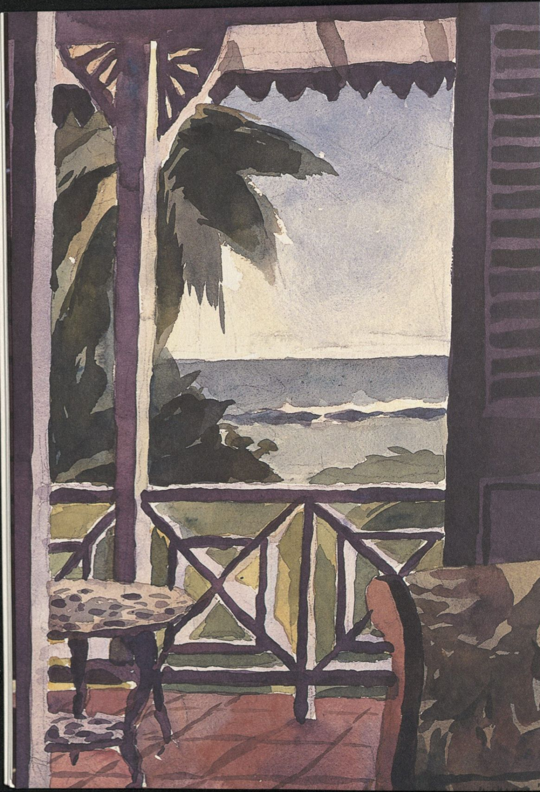
The Sea Outside 1998 Watercolour 17 x 13 inches