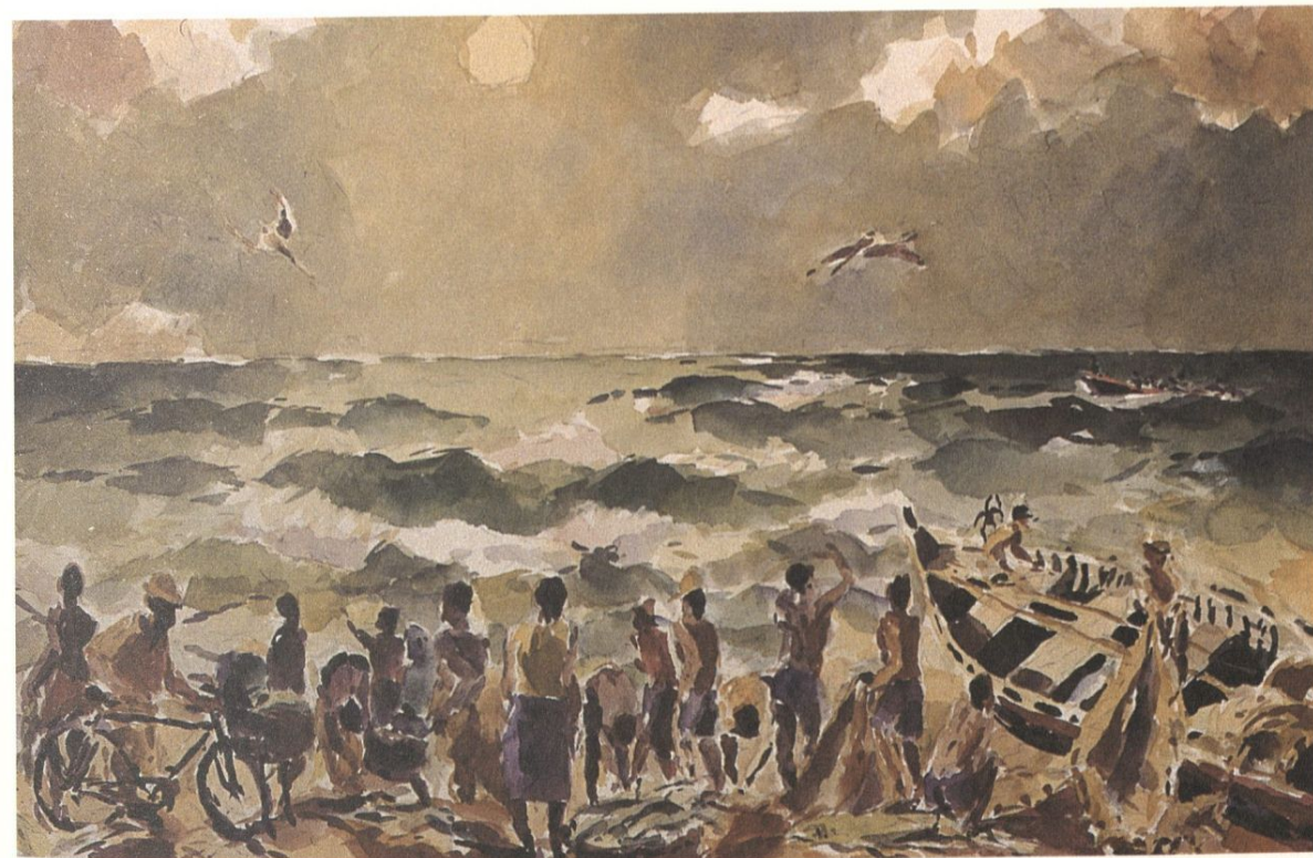
After the Seine 1999 Watercolour 26 x 41 inches